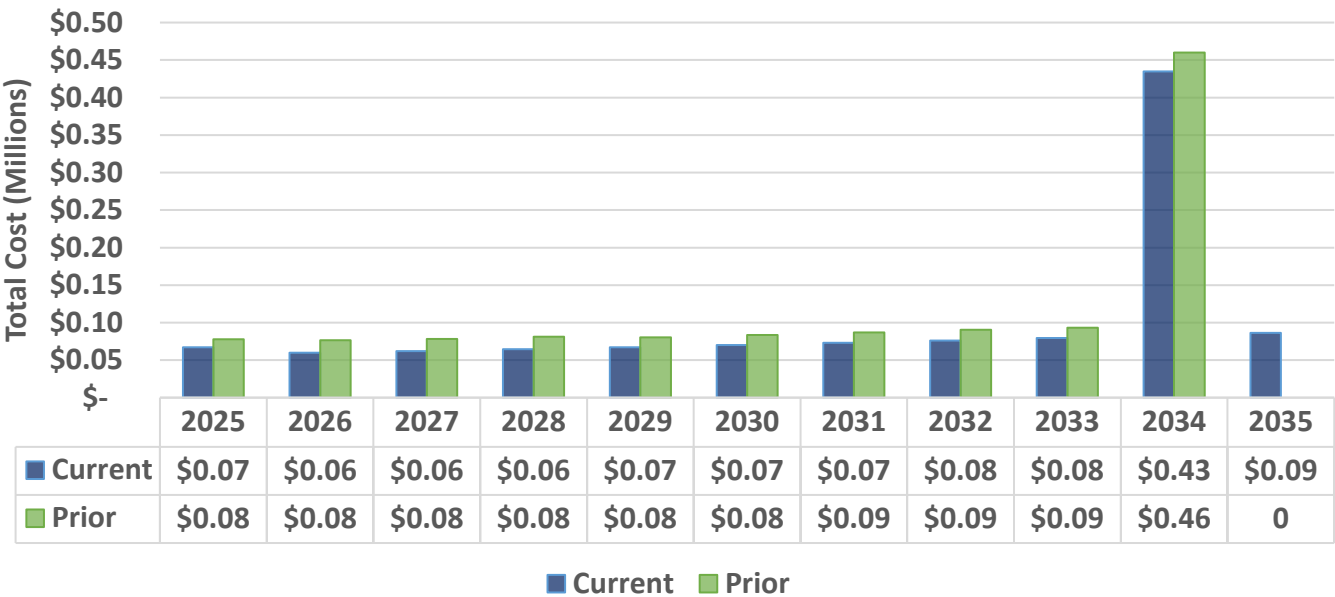
Sabine Creek Interceptor Total Cost Comparison