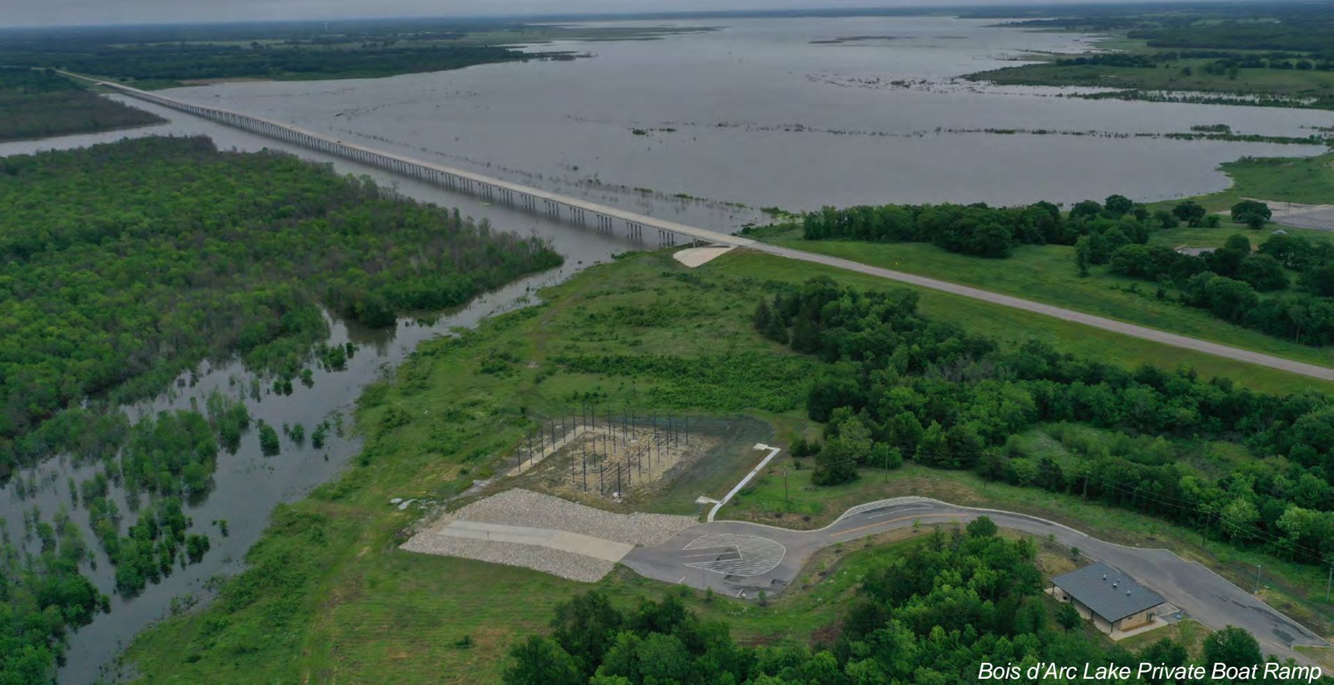
Bois d'Arc Lake Private Boat Ramp

Regional Service Through Unity... Meeting our Region's Needs Today and Tomorrow